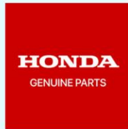
HONDA PARTS MANUFACTURING CORPORATION