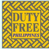
DUTY FREE Philippines